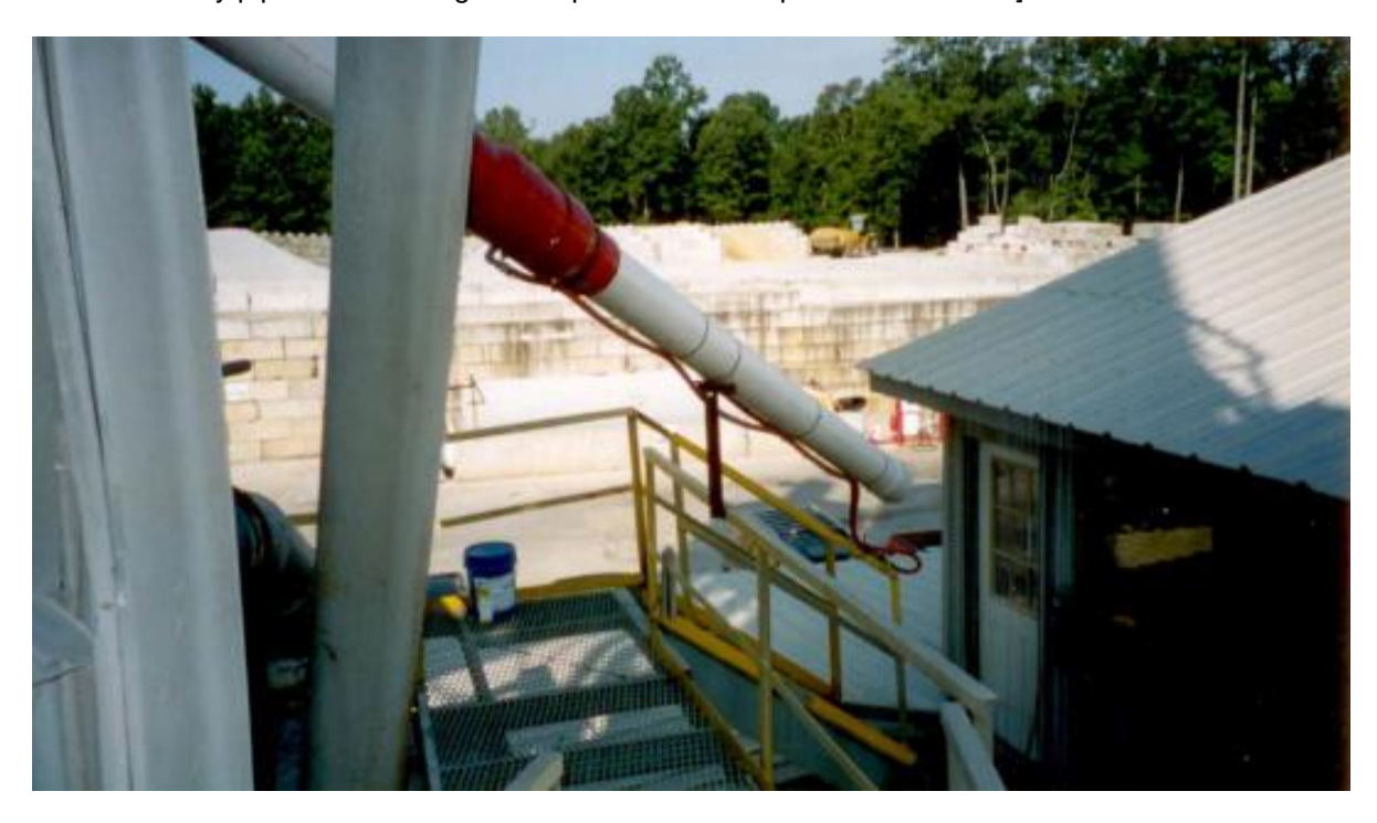
Initial pipe section should be 5 to 10 feet long to create vacuum.

[**NOTE: It is not recommended that this entry joint be glued, to allow for easier disconnection in the event the active unit or the entry pipe needs changed or replaced at some point in the future.]