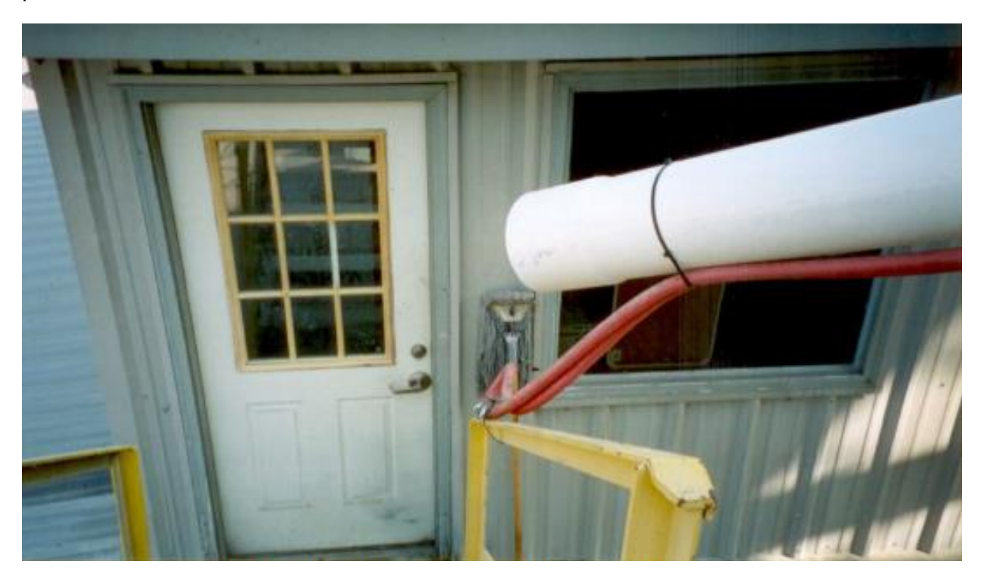
Fiber addition point located near product storage area.

It is desirable to have the starting or fiber-addition point as close as possible to the area where the fibers are stored. In some cases, this may be near the fiber-inventory storage shed, or even an open ground-level area where fiber cartons or pallets can be moved to, and covered or protected from the weather.